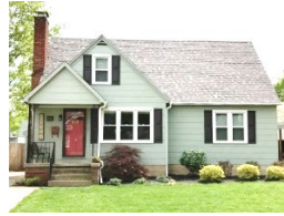
628 Commanche Rd (2013)