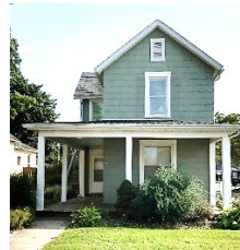
376 Arch Street (2018)