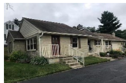
10 Dun Road (2021)