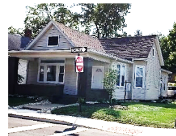
406 Arch Street (2019)