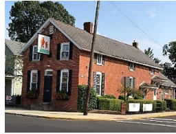
382 Arch Street (2018)