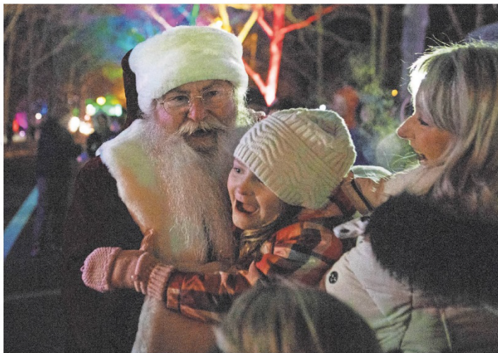
People came out to see the annual Christmas Tree Lighting on Nov. 18 in downtown Chillicothe.